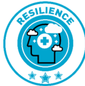
RESILIENCE NEVER GIVING UP, SHOWING A TRUE DESIRE TO LEARN