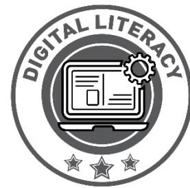
DIGITAL LITERACY USING TECHNOLOGY SAFELY AND RESPONSIBLY