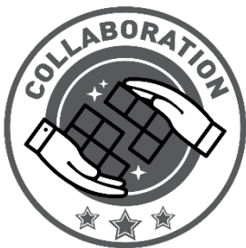
COLLABORATION WORKING COLLECTIVELY TOWARDS EXCELLENT OUTCOMES

The school believes that skills that prepare students for adult life in a dynamic, complex world are essential ingredients in our curriculum. These skills are developed within subjects and enrichment activities. Units / schemes of work are in a perpetual state of review and design for the cohort in front of the teachers. Curriculum planning, including individual lessons and units are designed to promote curious, interested learners who seek out and use new information to deepen their understanding and skills through challenge. Rather than adopt a lengthy, complicated list of twenty-first century skills (21C skills), the school adopted three that have grown in importance in the past two decades, and incorporate other skills that can be developed.