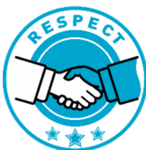
RESPECT SHOWING KINDNESS, UNDERSTANDING AND EMPATHY

In addition, the school goes beyond the minimum 'moral' education legal requirement of the UAE. Personal and health education are embedded within the school's vision, mission, ethos, and core values, and therefore this is integrated into all areas of the curriculum. Although moral education is only compulsory from Year 2 and above, PSHE is integrated from FS through to Year 13 with the core values being a prominent area of focus during circle time, tutor time, lessons, assemblies, and the school reward systems. Recently, the school was awarded the Character Education accreditation as a recognised 'school of character' by developing a set of specific values which underpin the learning and community. Respect, Responsibility, and Resilience are the three core values that we believe, as a community, are pivotal when developing the next generation of learners. By explicitly teaching students about these values, and working in partnership with our parents, the school is able to develop students socially, emotionally and intellectually.